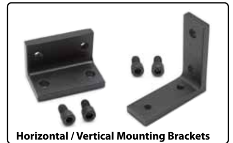
Horizontal / Vertical Mounting Brackets