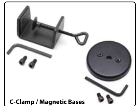
C-Clamp / Magnetic Bases